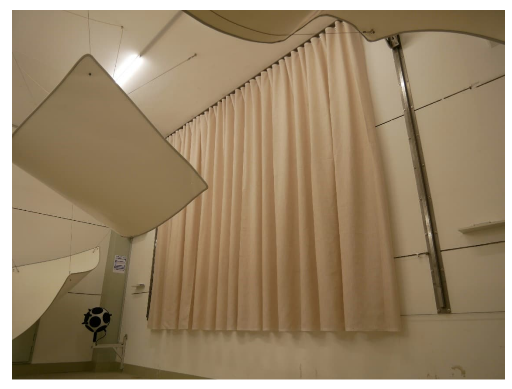
Figure B.2. Test object mounted in the reverberation room, diagonal view.